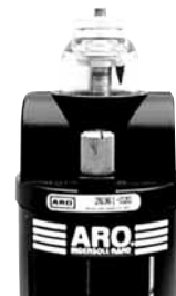
26361-220 with tamper Resistant Cap